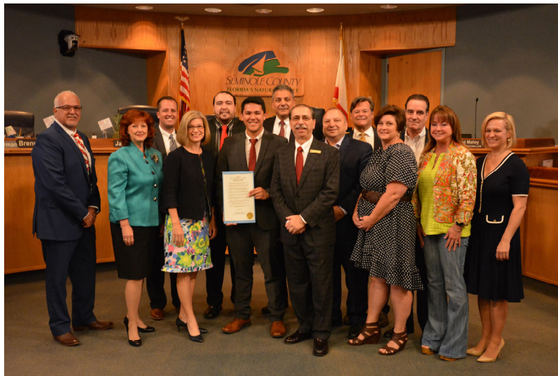
Seminole County's "National Travel & Tourism Week" Proclamation