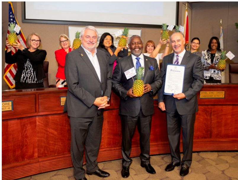
Orange County's "National Travel & Tourism Week" Proclamation