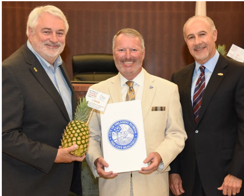
City of Orlando's "National Travel & Tourism Week" Proclamation