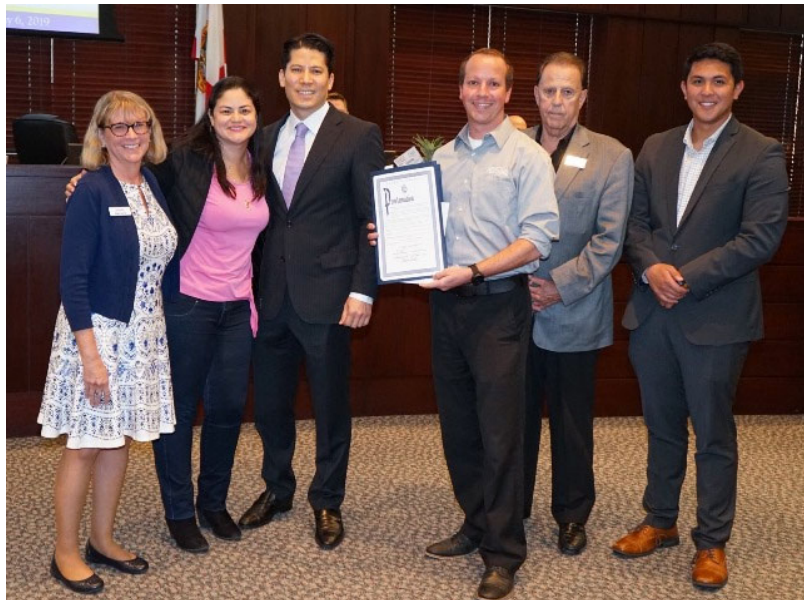
Osceola County's "National Travel & Tourism Week" Proclamation