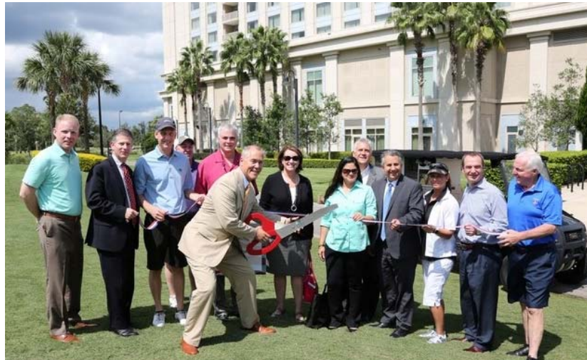
The official ribbon cutting ceremony to open the Tee It Up for Tourism Golf Outing