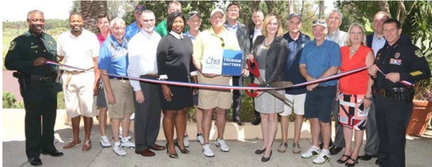
CFHLA Board Members and Elected Officials "Cut the Ribbon" to start the PC Golf Outing