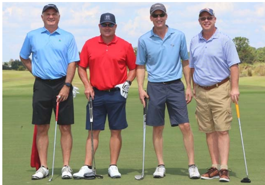
CFHLA Members preparing to "Tee it Up for Tourism"

For additional photographs, please CLICK HERE .