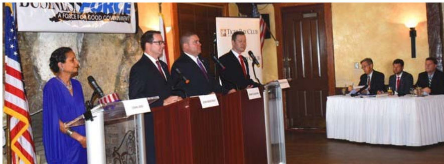
Republican Candidates for House District 44 participate in the Tiger Bay Debate