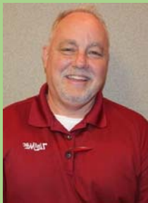
Pete Woodruff Southeastern Laundry Equipment