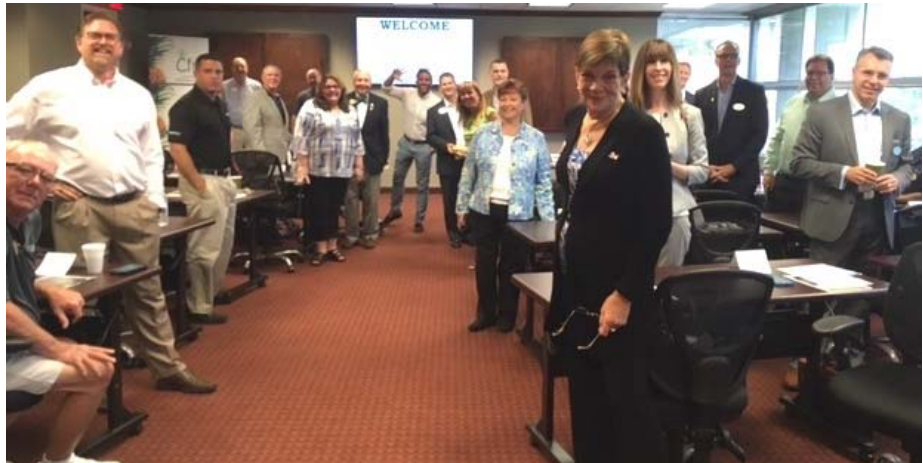
CFHLA VIP and Lodaina Members enjoyed a networking breakfast