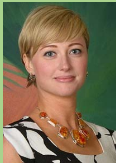
Lana Burke Homewood Suites Orlando International Drive / Convention Center