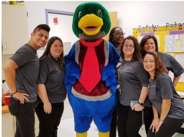
The Orlando Vineland Premium Outlets spent the day with the students at the Simon Youth Academy.