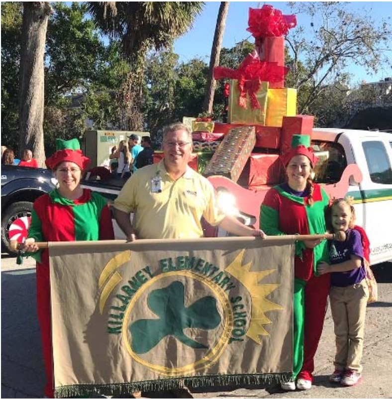
This is the 5th year Massey Services has sponsored Killarney's participation in the Annual Christmas Parade.

sponsored their Adopt-A-School Partner, Killarney Elementary, for their annual participation in the 65th Annual Winter Park Christmas Parade.