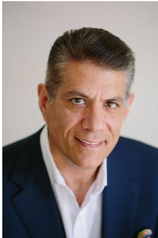
New 2017 CFHLA Board Member