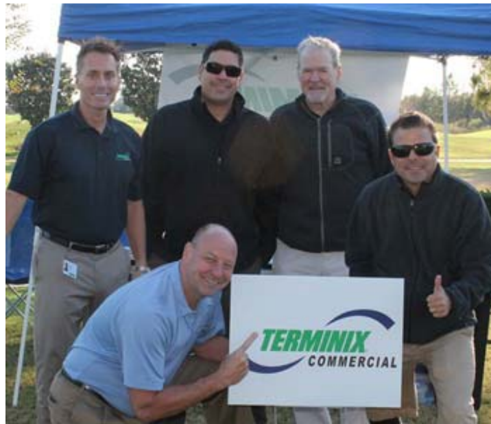
Corporate Sponsor Terminix having fun at their hole