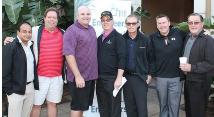
CFHLA Engineers Council Board Members ready to Golf!