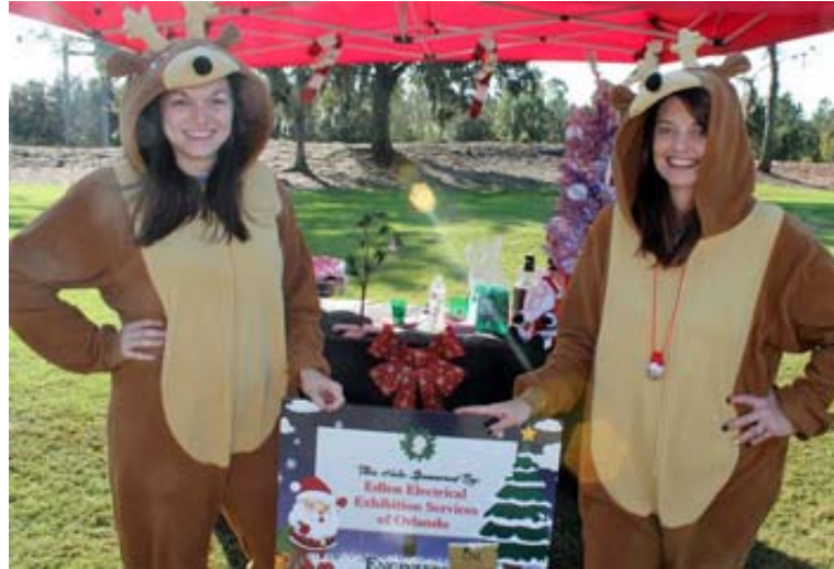
A couple of Santa's Reindeer visit the Edlen Electrical Exhibition Services of Orlando Hole Sponsor booth