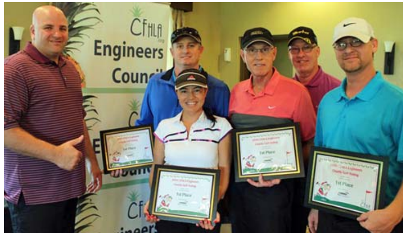
First Place Team - Remediation Specialists