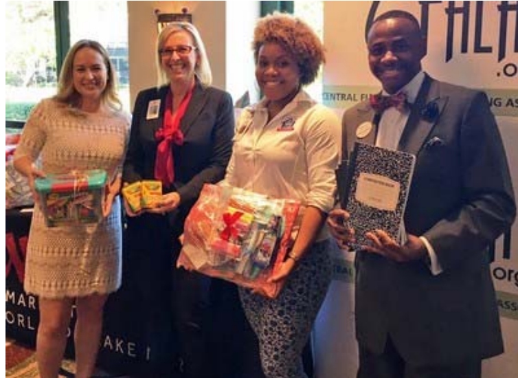
Seminole County Public Schools and Families in Need staff with donations from the CFHLA Cares Drive