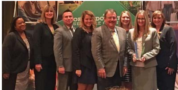
Orlando Marriott Lake Mary sales team accepting their award for Outstanding Hotel Sales Team