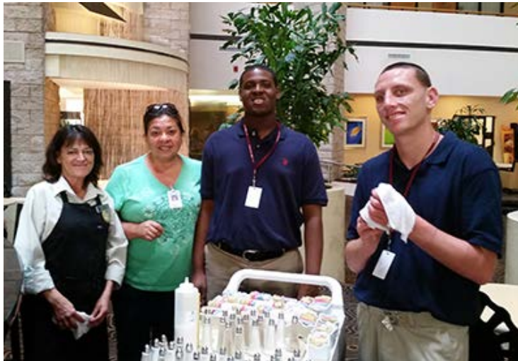
Magnolia School Students assist the Food & Beverage Department with set-up and gain real-world Hospitality Job Experiences

at the Embassy Suites Orlando I-Drive / Jamaican Court