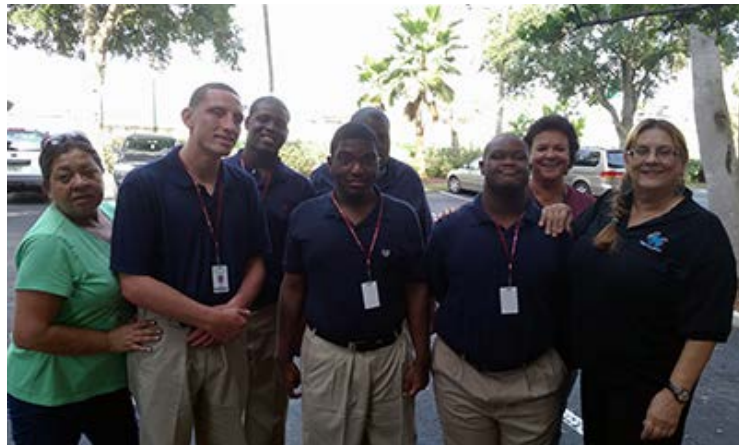
Magnolia School Students arrive for their first day of training

Additionally, this program provides the students with a connection to worksites to gain real-world experiences, including rotating job experiences at the Embassy Suites Orlando I-Drive / Jamaican Court!